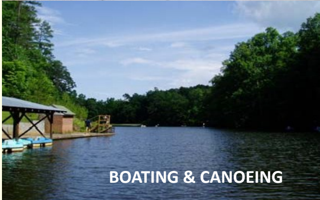
BOATING & CANOEING